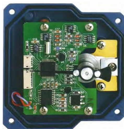
ADT-15 Indicator Housing + Transmitter 4-20 mA